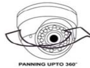
PANNING UPTO 360°