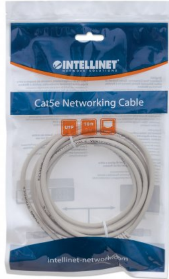
3 m (10 ft.) shown