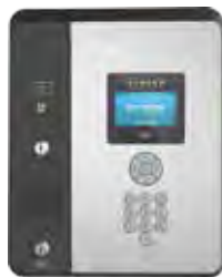
e3 Tele Entry Systems