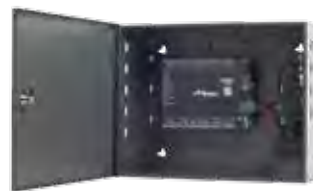
e3 Essential & Elite Systems

Comprehensive embedded OS and browser-managed access systems