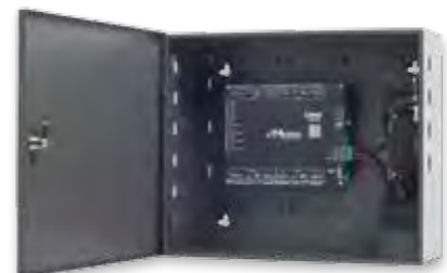
eMerge Essential Plus™