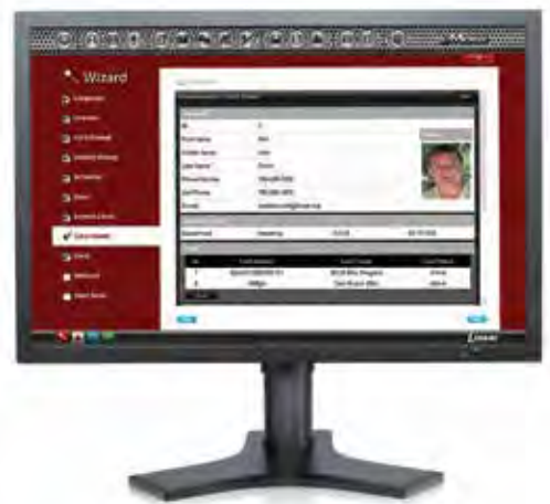
Quick-Start Setup Wizard: Saves Hours of Time Getting You Up and Running