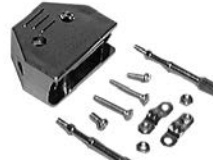
* Captive Thumbscrew