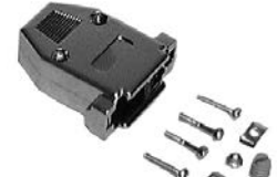
Metalized plastic with side screw strain relief.