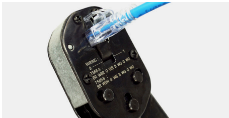
WIRE PATTERN ALIGNMENT Where you most need it, right under the crimp socket