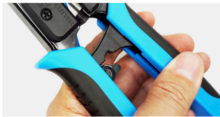
RATCHETED for Full Compression Cycle

Simply Better Quality, Simply Easier to Use, Simply More Affordable