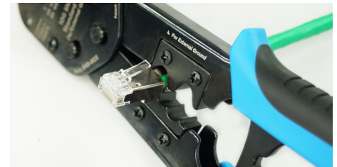
CRIMPS EXTERNAL GROUND ARM (S45-C250 Exclusive Feature)

For more information visit www.simply45.com