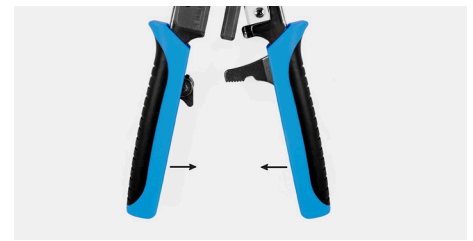
SYNCHRONIZED HANDLE for Smoother and Easier Crimping Cycle