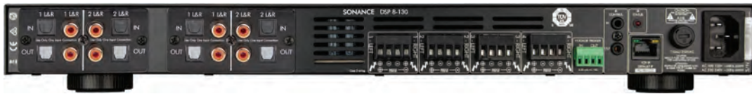
SONAMP DSP 8-130 Amplifier with (2) installed Digital Input Modules