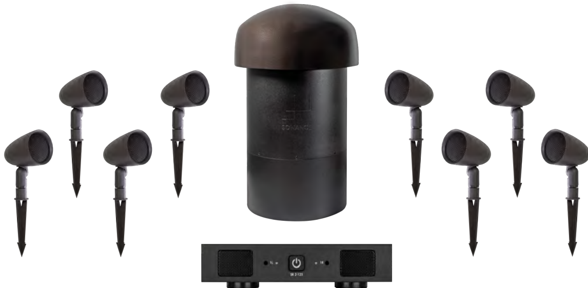
SGS System SKU 93433 | MSRP $4,000

8 SGS SATELLITES | 8 GROUND STAKES | 1 SGS SUBWOOFER | 1 2-125 AMPLIFIER