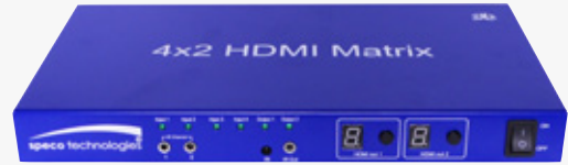
front of unit