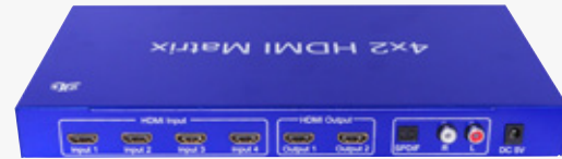
rear of unit