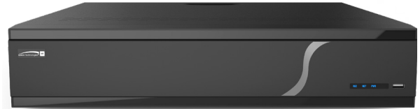
Front View N64NR