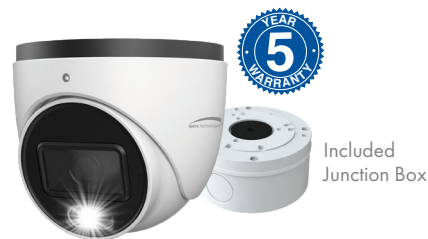
Included Junction Box