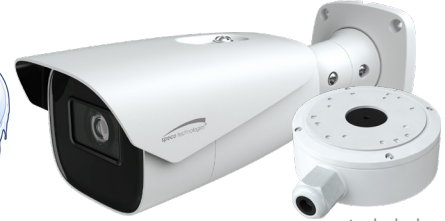
Included Junction Box