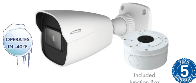
Included Junction Box