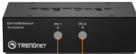
PC selector buttons