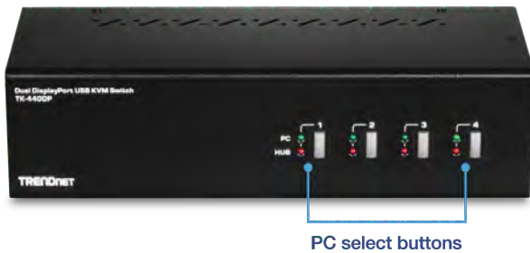
PC select buttons